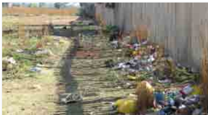
Eldorado Park: Before

During the 90 days Accelerated Service Delivery Programme, City Parks scooped a few awards which showed that the company's efforts do not go unnoticed: