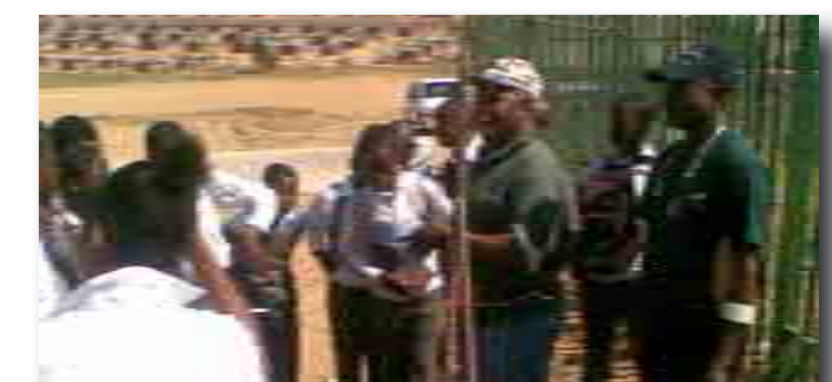
Cosmo City Secondary School no.3