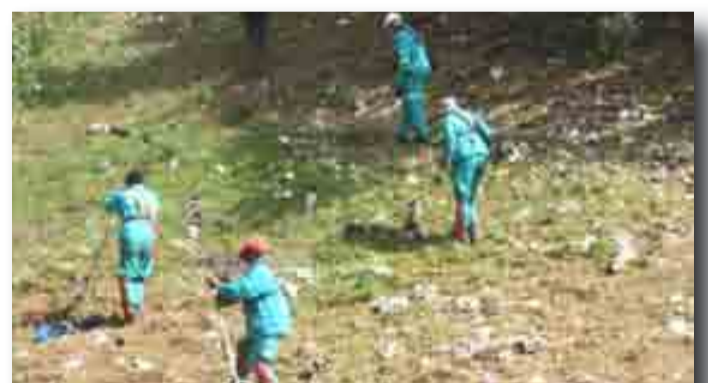
Clean-up: Pullinger Kop

Call complaints or service requests should be logged at Joburg Connect on 011 375 5555 - option 0