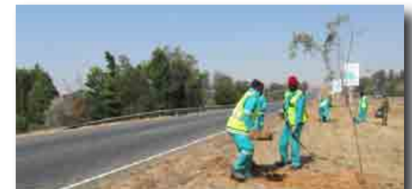
Tree planting: Northumberland Drive, Region C