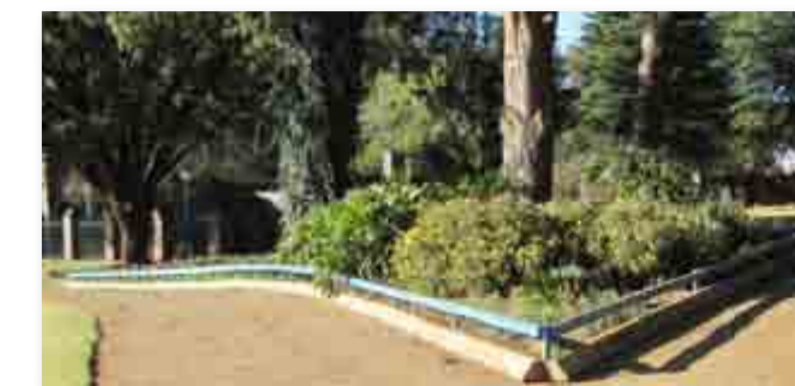
Litter free Florida Lake, Region C