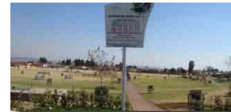
Eldorado Park Ext 3, Region G

Accelerated interactions with media, residents and key stakeholders. Hosted Mandela Day, Arbor Day and The Clean City Campaign. Issued statements on various seasonal service delivery issues.