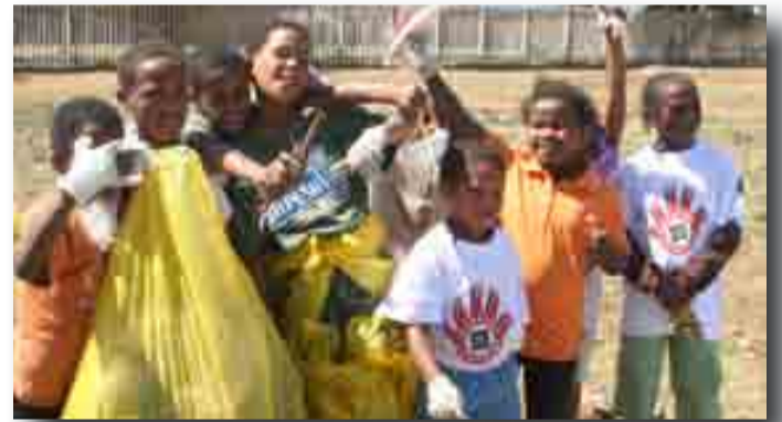
Clean-up: Eldorado Park