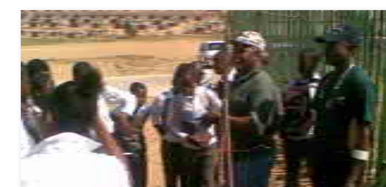
Cosmo City Secondary School no.3