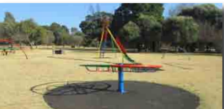
Community Parks maintenance in Cosmo City, Region C