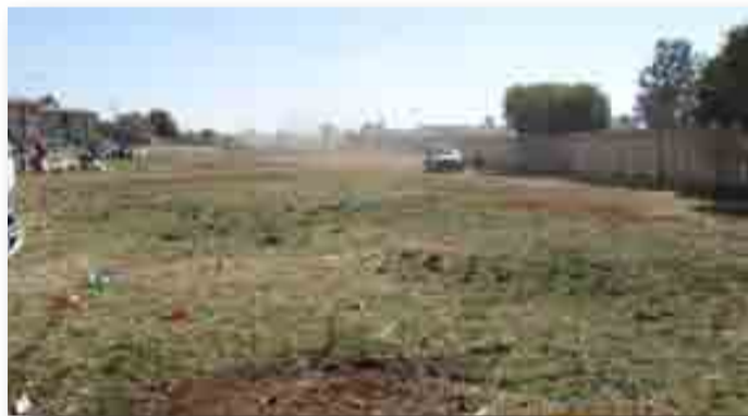
Eldorado Park: After