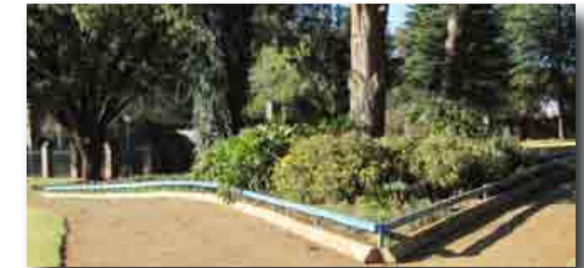
Litter free Florida Lake, Region C