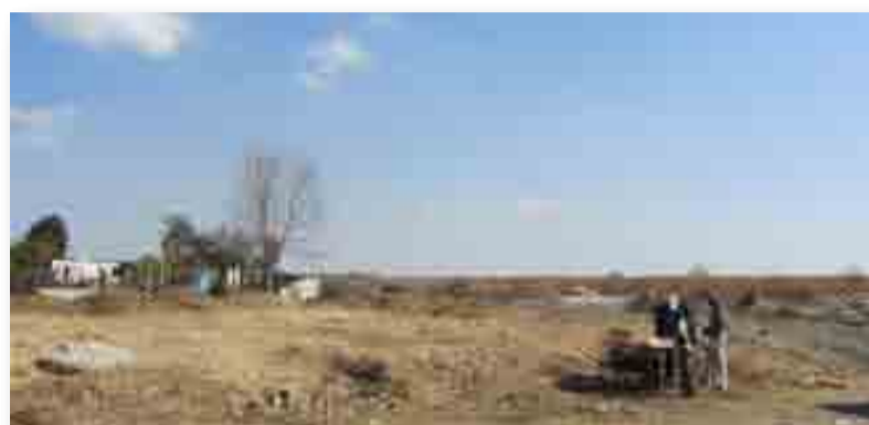
K60 Informal Settlement, Region A