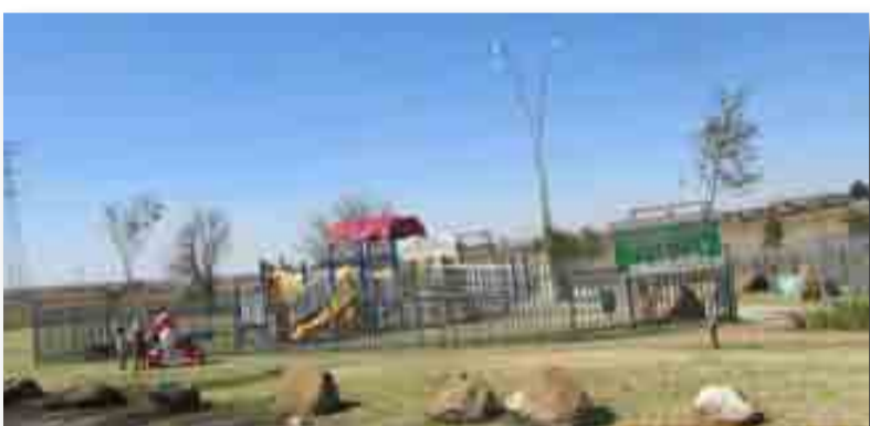
Dhlamini Eco Park, Region G