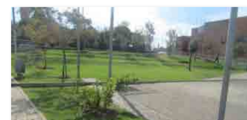
Hector Pieterse Precinct, Region D