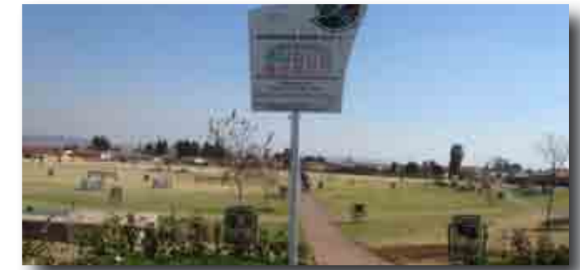
Eldorado Park Ext 3, Region G

Accelerated interactions with media, residents and key stakeholders. Hosted Mandela Day, Arbor Day and The Clean City Campaign. Issued statements on various seasonal service delivery issues.