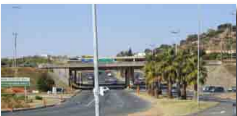
Hendrik Potgieter Rd, Region C