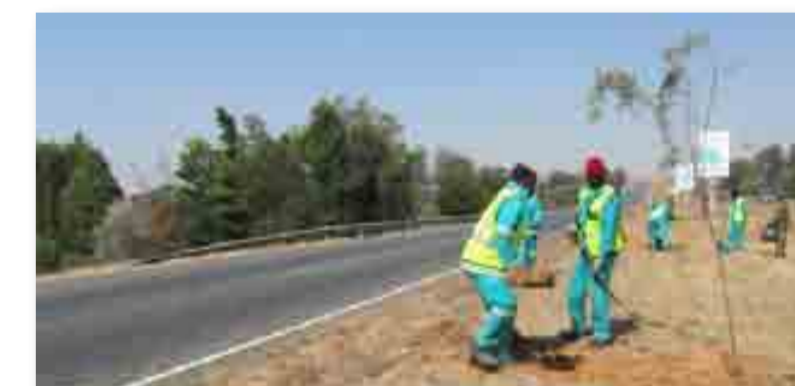
Tree planting: Northumberland Drive, Region C