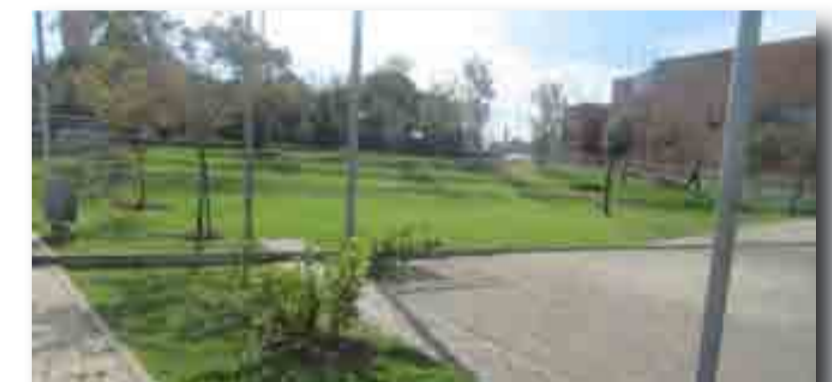
Hector Pieterse Precinct, Region D