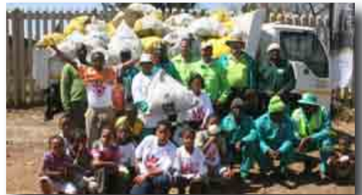
Clean-up: Eldorado Park